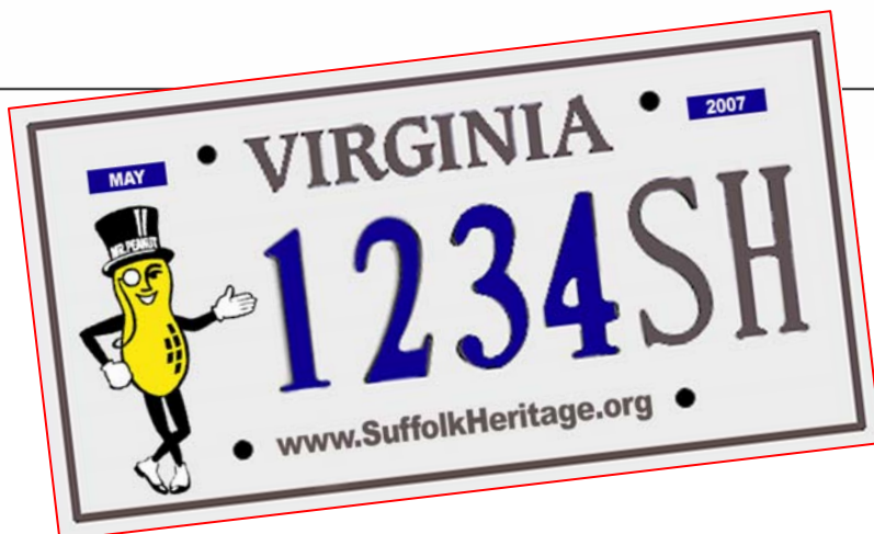
SAMPLE CITY OF SUFFOLK LICENSE PLATE TO BENEFIT VIRGINIA 2007 PROJECTS AND EVENTS